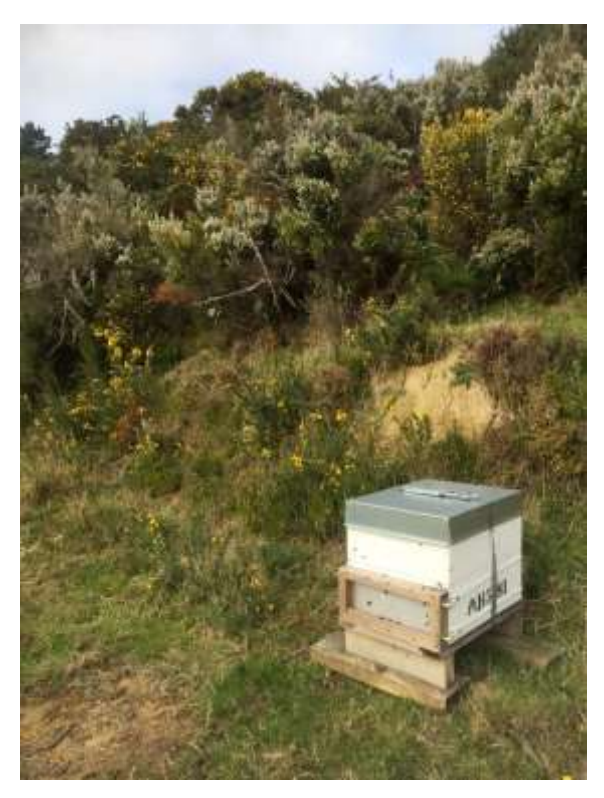
Hive with robbing guard. Heath and gorse flowering behind

Just to finish, wintering down hasn't happened as planned, but I only have myself to reprimand for that. I've removed extra surplus supers, queen excluders, given an Apiherb supplement and applied varroa treatments where needed. I will need to return to each hive in a few weeks to remove these treatments and settle hives down for winter.