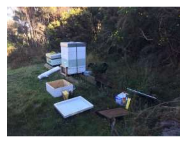
Getting ready for wintering down. Building paper to be used for hive wrapping

Conclusion is I should have alcohol varroa counted when extracting honey supers. It would have told me where my hives were at and therefore testing post treatment would have been targeted as opposed to completely random. It would have also accurately indicated to me at the start, if treatment used was effective and if my bees are being re-infested continually in this robbing period. Commercial beekeeping activity is doubling in my neighbourhood year on year. Bee activity around the area is intense from over stocking, so I therefore suspect varroa re-infestation is occurring but I do don't have conclusive data to support this.